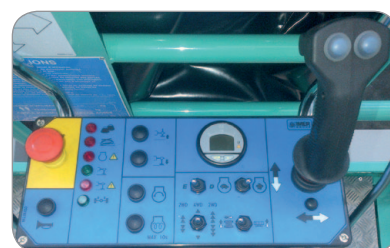
Sturdy, simple and intuitive control box on platform